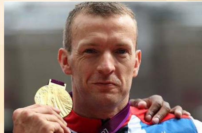
Richard Whitehead – Gold Medalist T42 200m, London 2012